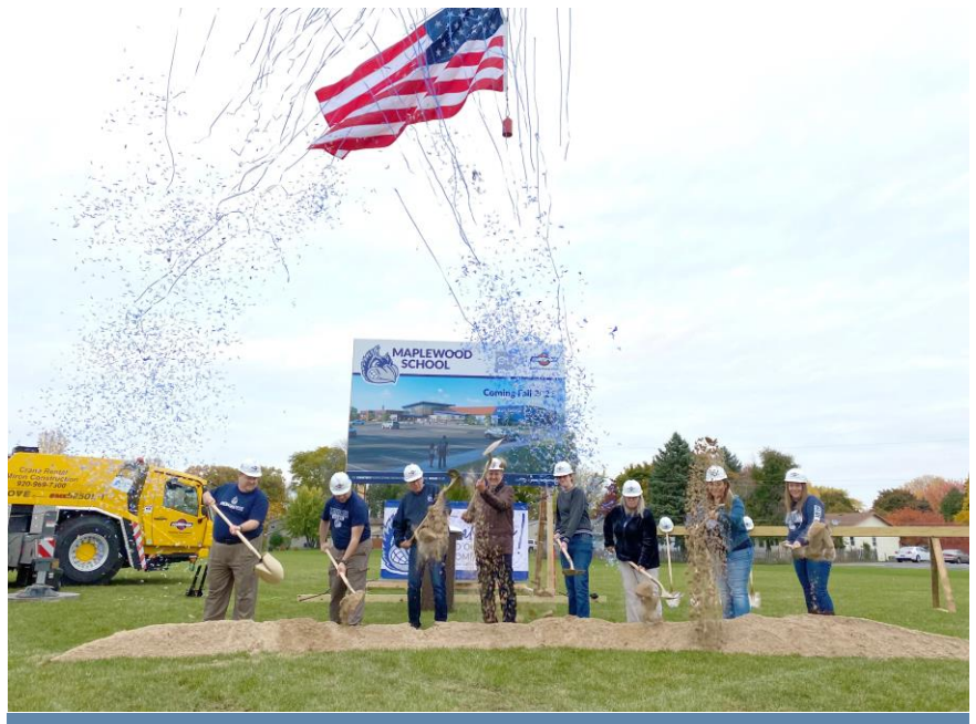
Menasha Joint School District Board of Education members lead the ceremonial shovel turn at Maplewood School.

Thank you to all who attended this exciting event!