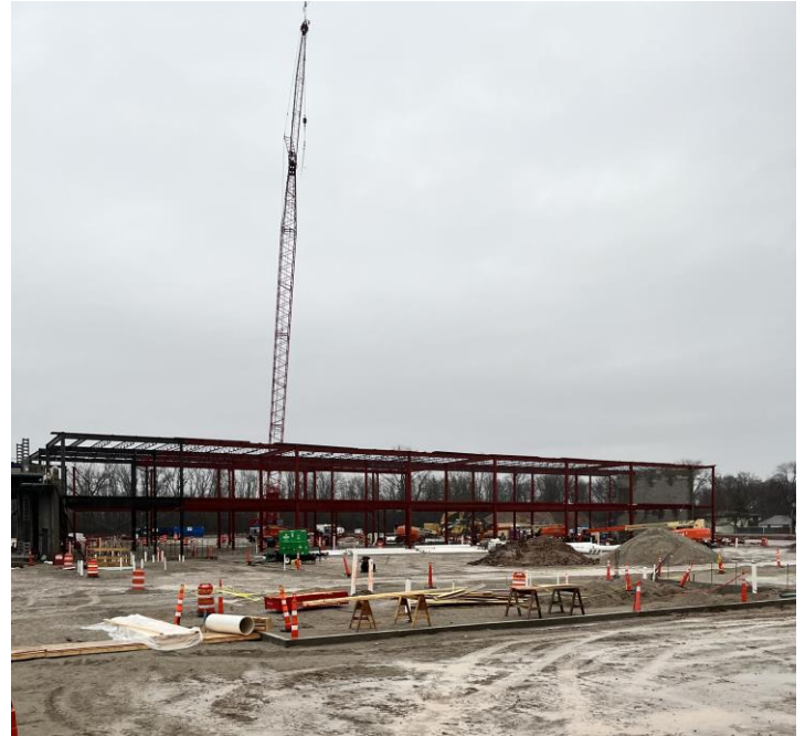
Steel is being erected in one of the classroom wings.