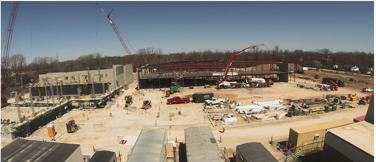
View from our live stream job site camera, taken April 15, 2024.