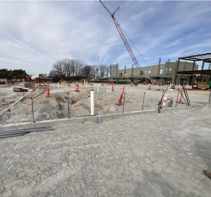
Building foundations are almost complete, as well as underground plumbing and electrical.