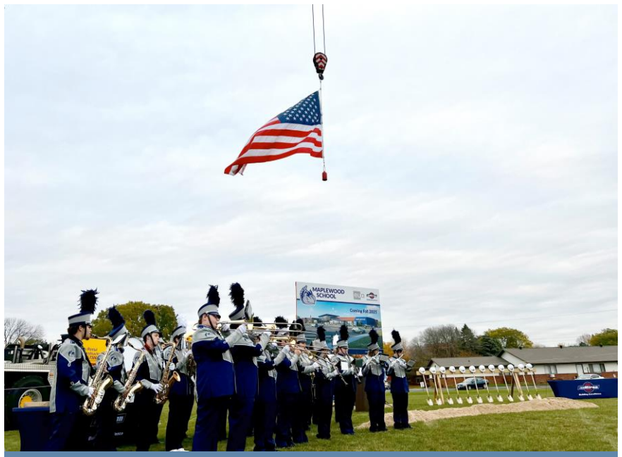
Maplewood Middle School Band plays during the groundbreaking ceremony.