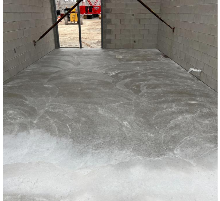
Concrete is being poured in the stairway shafts.