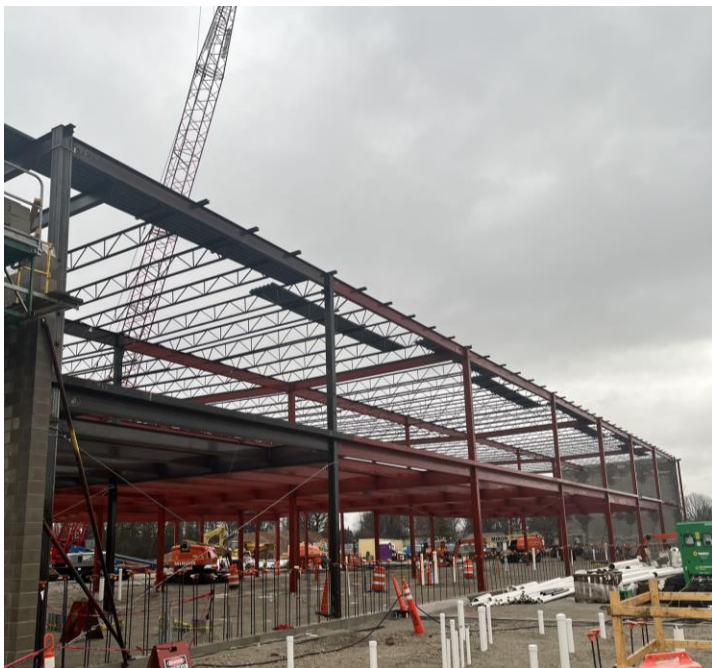
Another view of the steel being erected in the classroom wings.