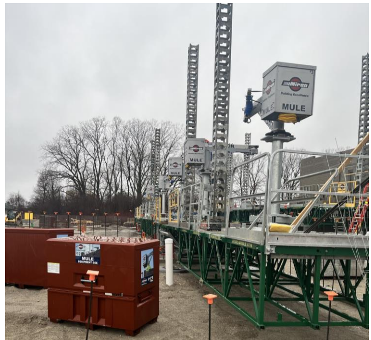
Masonry for the kitchen, culinary, and lab areas is currently being installed.